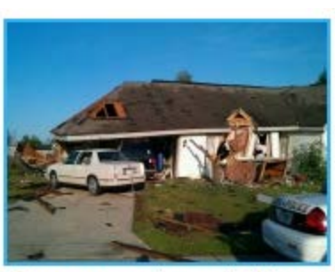
Damage to a house in Macon (Bibb County).